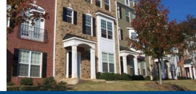
CID Studies Commuter Shuttle Feasibility

According to a survey by the Transit Planning Board, many Atlanta-area residents are willing to put their money where their mouths are when it comes to transit. Conducted early in 2008, the study of 10 metro counties found that 85 percent of residents want to increase the investment in public transit. More than half of respondents even support a one percent sales tax to fund it.