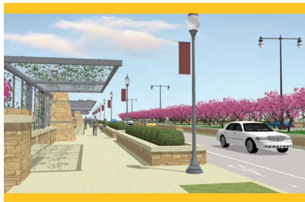
Future remodeling of the Encore Parkway Bridge would not be possible without partners like the City of Alpharetta.

In 2010, the CID worked closely with the three cities in the CID – Alpharetta, Milton and Roswell – along with various government and public agencies to make an impact on the District. Thanks to the support of the cities, the Georgia Department of Transportation and the Windward Business Association, the CID is another step closer to realizing its vision for North Fulton.