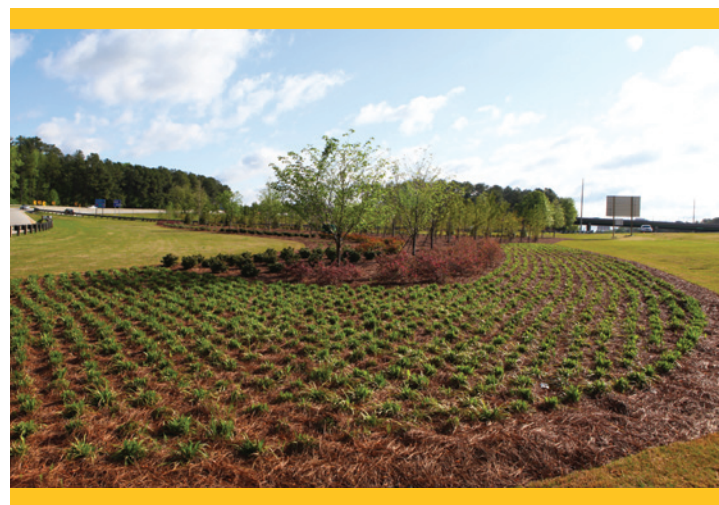
A grand vista now greets travelers at Haynes Bridge Road and Georgia 400.

At 5 Woodward Parkway and Georgia 400 , the North Fulton CID installed sod, stacked-stone walls and landscaping, a $1.2 million investment. Landscape maintenance will continue for three years at this interchange, with the goal of welcoming employees, residents and visitors to North Fulton.