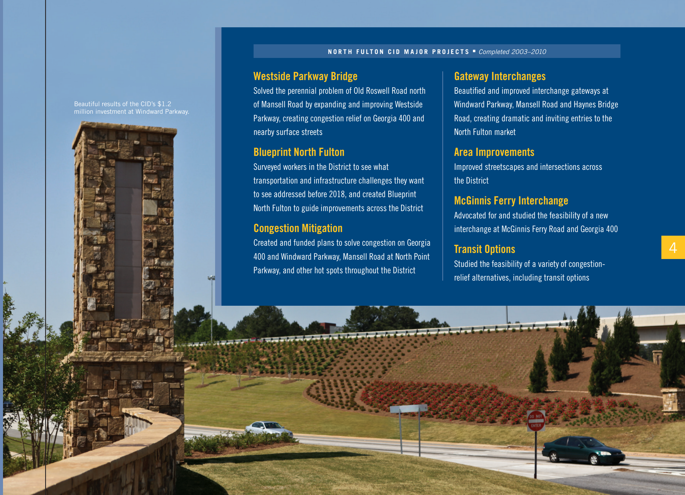
Beautiful results of the CID's $1.2 million investment at Windward Parkway.