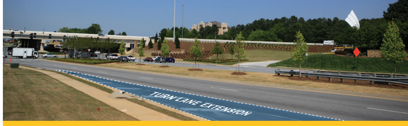
The Georgia DOT, partner of the CID, will fund several traffic improvements at the Windward Parkway-Georgia 400 interchange, including a free-flowing right-turn lane from the northbound exit ramp to North Point Parkway.

“It’s our members and partners that make our strategy work. With their support, the CID invests wisely to move projects forward quickly for the greater good of this community.”