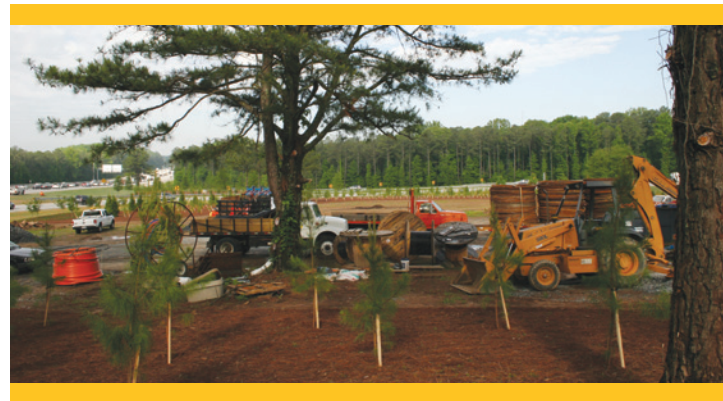
Workers remake the Haynes Bridge interchange.

The strategy is proven. Members pay an additional commercial property tax to benefit the corridor. By jump-starting projects, creating designs, proposing ideas and making things happen more quickly, the CID turns this investment into millions of dollars worth of area improvements.