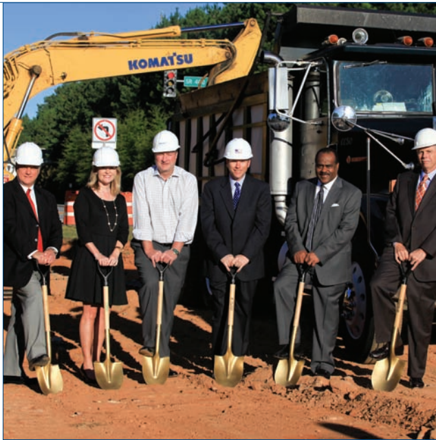
CID breaks ground on a new triple-left turn lane on Mansell Road.

« The North Fulton CID is steadfast in driving projects forward that create clear and measurable benefits for commercial property owners in the area. »»