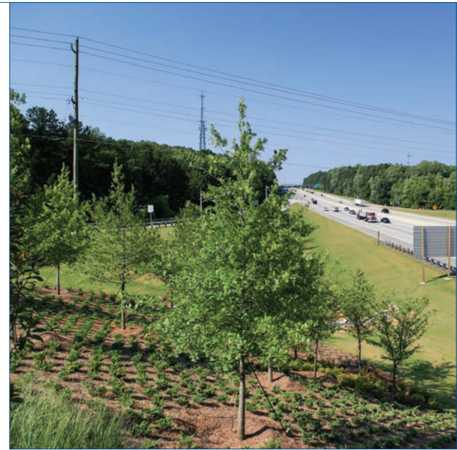
New landscaping will dramatically enhance all four quadrants of the Georgia 400 interchange at Old Milton Parkway.

The CID is focused on providing a strong return on the investments it makes throughout the District. By making an initial investment and creating a greater impact, the CID is assuring the ongoing prosperity of Georgia 400's commercial corridor in North Fulton.