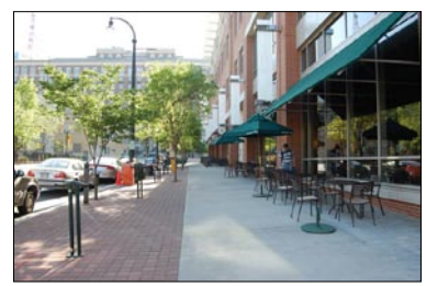
Preferred Street and Circulation Images