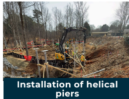
Installation of helical piers