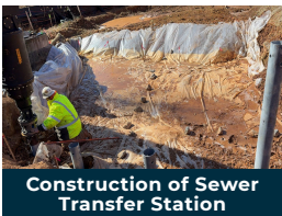
Construction of Sewer Transfer Station