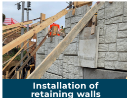
Installation of retaining walls