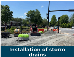
Installation of storm drains